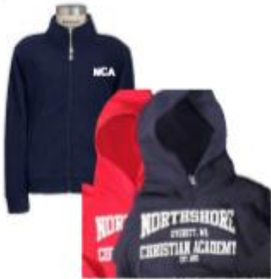
Sweatshirts and Hoodies Suggested price: $5-10