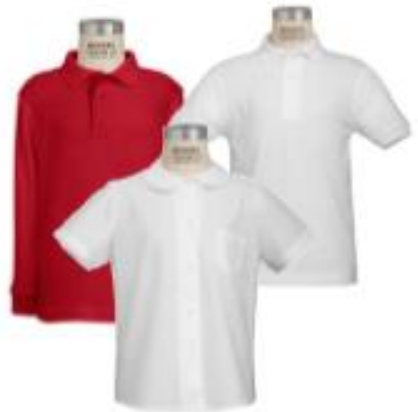
Blouses and Polos Suggested price: $2 and up