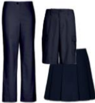
Blue Uniform Items Suggested price: $5 and up