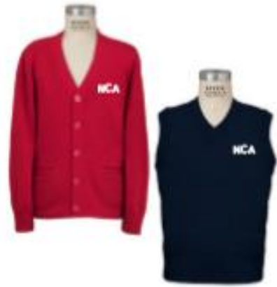
Vests and Cardigans Suggested price: $10