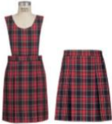
Plaid Jumpers and Skirts Suggested price: $15-20