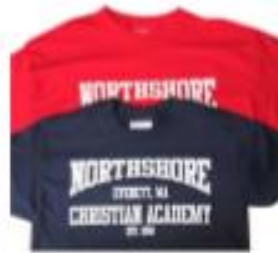
PE Shirts Suggested price: $2